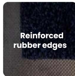
Reinforced rubber edges