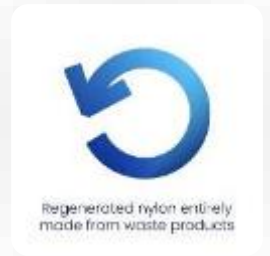
Regenerated nylon entirely made from waste products